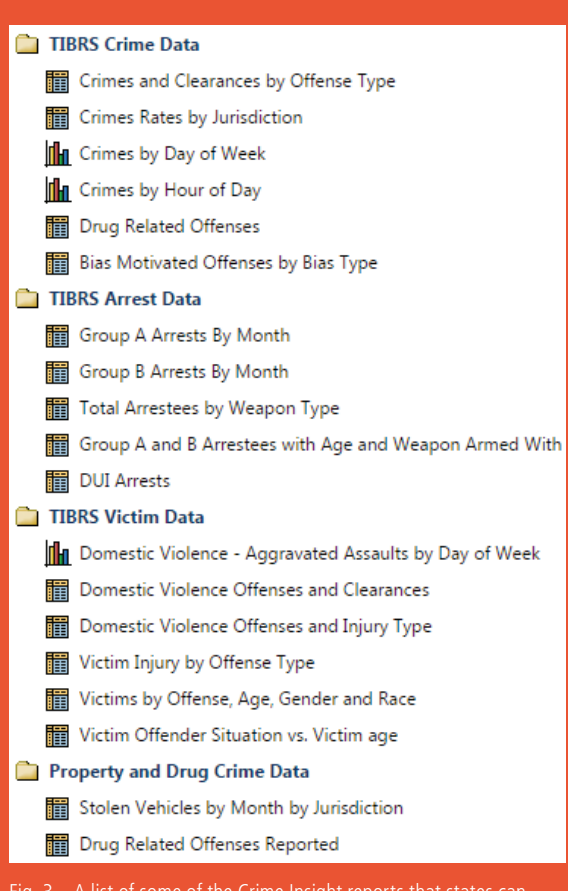
Fig. 3 – A list of some of the Crime Insight reports that states can make available for law enforcement agencies to review.